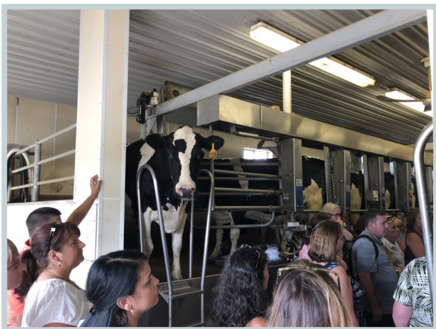
Dinitto's Dairy Farm Tour