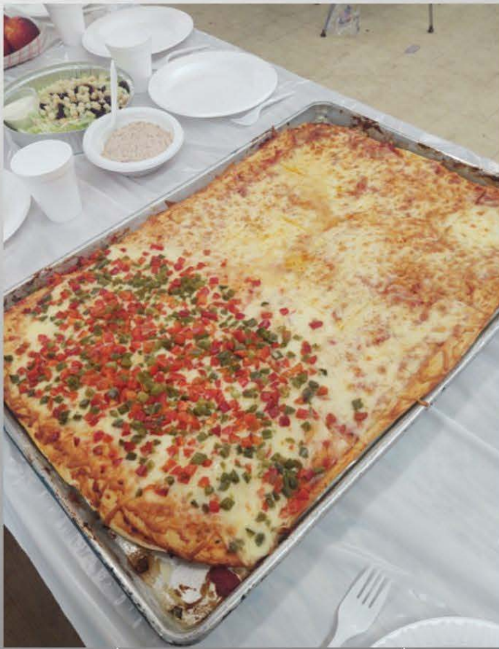
Fresh Vegetable & Cheese Pizza!