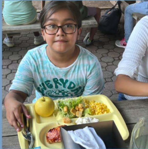
FRESH FRUITS AND VEGETABLES