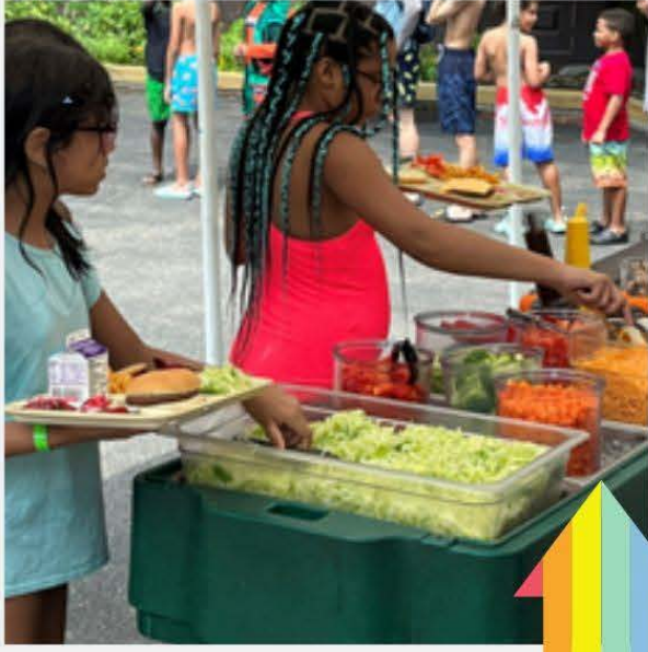
COLORFUL DISPLAY OF FOOD ITEMS