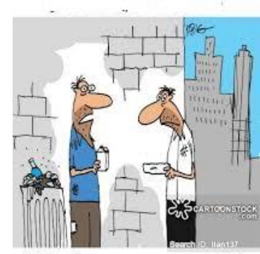
"I'll trade you my government dried milk for your government dried eggs."