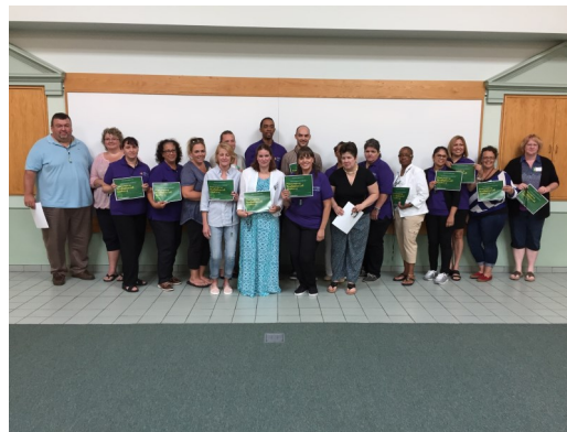
Class of 2016

Provides 15 training hours of required School Nutrition Program Training